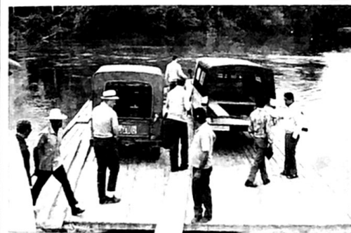
Cruzeiro do Sul Conference. Ready to cross the Moo River in the ferry on the way to Japim and Colonia.