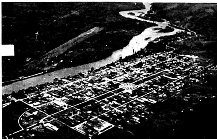
Airplane view of the city of Tingo Maria, Peru. The white square in the middle left of the picture is near the lot on which Crain is building a church.