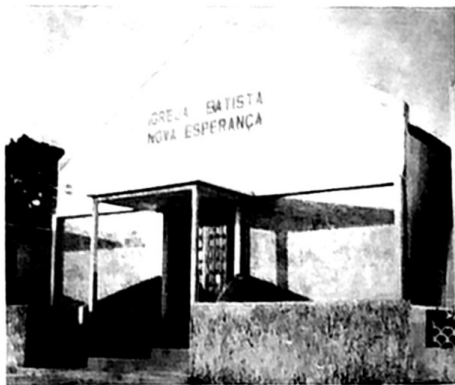
New building of New Hope Baptist Church, Sao Luis, Maranhao, Brazil. Built by George Bean. Best non-Catholic building in the city.