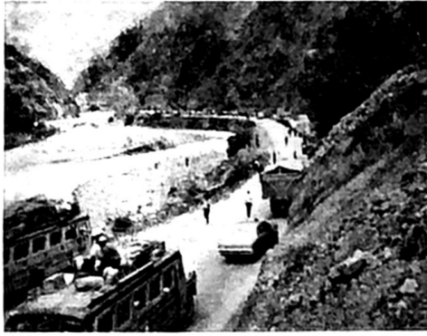
Line up of cars, trucks and busses two hours out of Lima, Peru, Two days wait here for the mountain landslide to be moved off the highway.