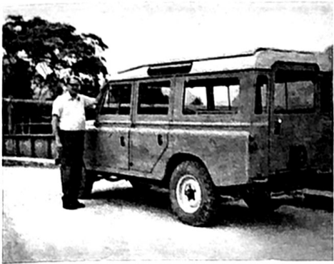
Homer Crain and the Land Rover four wheel drive, aluminum body, station wagon on the bridge at Tingo Maria, Peru. All paid for.