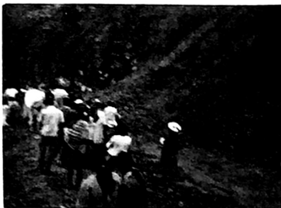
Mountain landslide across the highway between Huanuco and Tingo Maria, Peru. This slide was about 30 feet high. People waiting for bulldozer to clear the road.