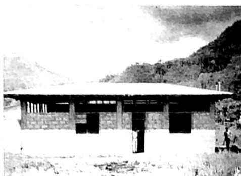
Mission building that Homer Crain rented to hold services in, Tingo Maria, Peru. The building is already too small to hold the crowds.