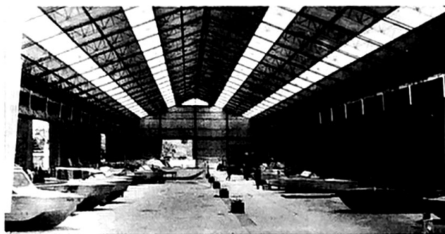
Inside the factory, Pucallpa, Peru where the aluminum houseboat is being built by Del Mayfield.