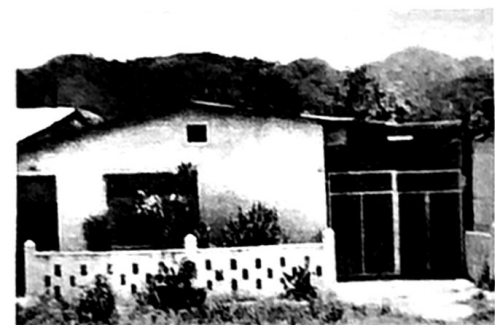
House in Tingo Maria, Peru that the Homer Crains live in. Note the garage at right with steel gate and lock that the new Land Rover station wagon will be kept in. Note mountain in the rear.