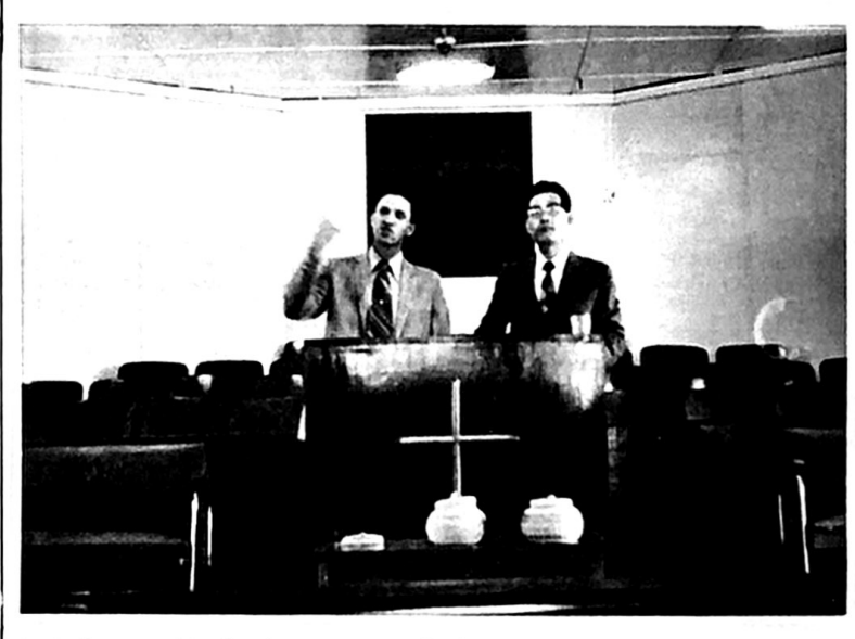
ching through an interpreter in Seoul, Korea. 32 professions of faith in one month.