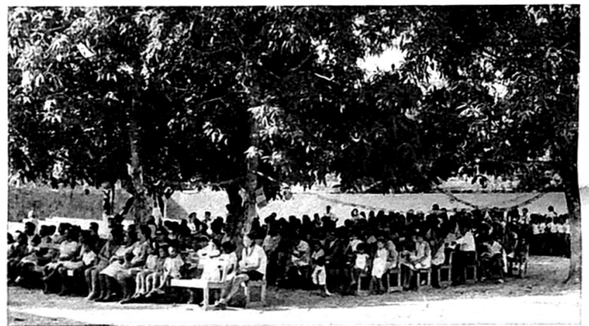
Parents and others that came to see the "Independence Day" program in Pucallpa, Peru.