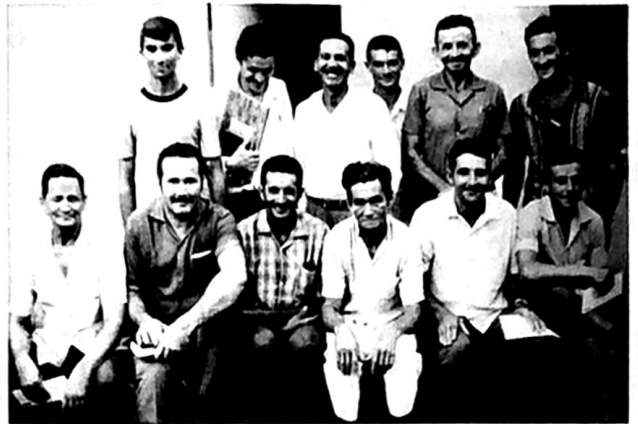
Men representing the various churches in Cruzeiro do Sul area at the second meeting of the directors of the mission there. These preachers and laymen are a result of your offerings to this mission work.