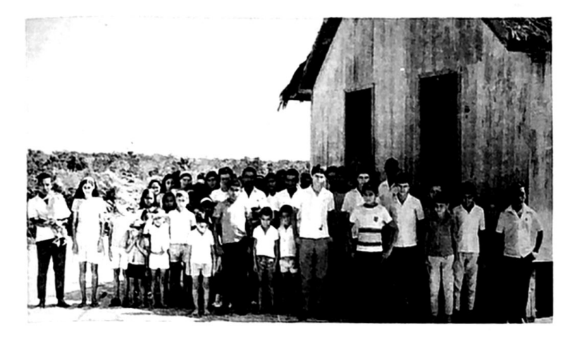
Church at Mourapirango, near Cruzeiro da Sul, Acre, Brazil, June, 1971. This building is being taken by the army for a new airport.