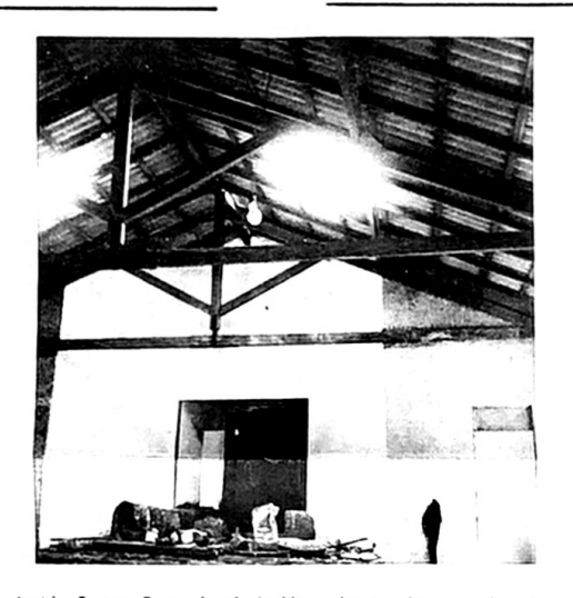
Inside George Bean church building showing bea overhead. Pictures of building taken June 17, 1971.