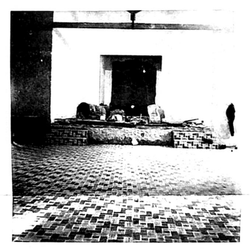
Inside George Bean church building rostrum for pulpit and opening for baptistry. church building showing tile floor,