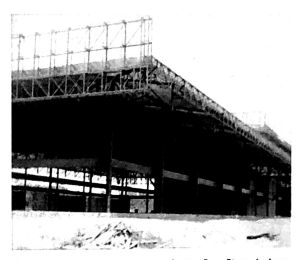
New Airport building under construction at Iquitos, Peru.