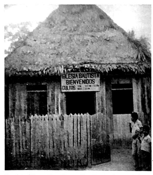
Church building at Tamshiyacu, Peru. Up the Amazon River above Iquitos, Peru. This is one of our best native churches.