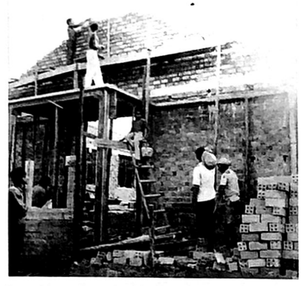
Front of George Bean church building showing porch over front door, Sao Luis, Maranhao, Brazil. The building is now under