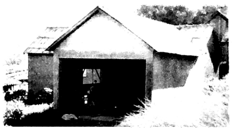
Warehouse and garage that Creiglow built in Cruzeiro do Sul, for storage of gasoline, boat, motor, trailer and jeep.