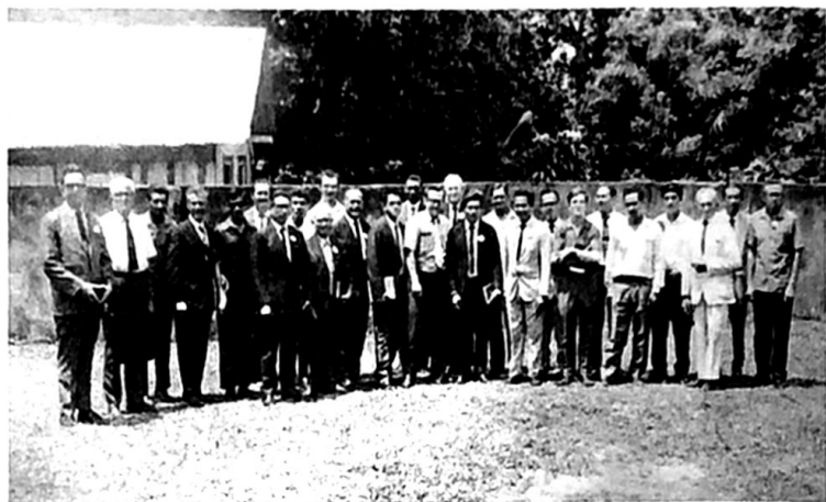
About half the preachers that attended the Conference in Manaus, Brazil. The wall in the rear goes all around the property.