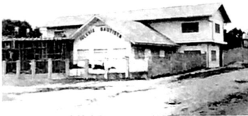
Church at Pucallpa, Peru showing partially finished auditorium at left. The church will not hold the people that come.