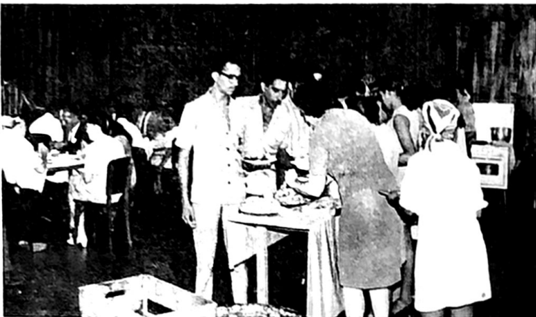
Manaus, Brazil Conference Dinner Time. Inside School Auditorium. The stove is from the launch. Food furnished by native churches.