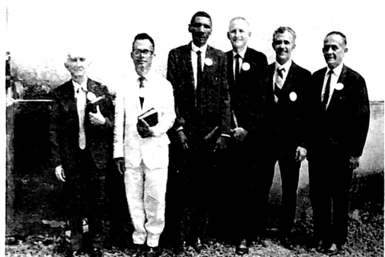
These preacher brethren came from the State of Maranhão on the Atlantic Coast, to the Manaus Conference.