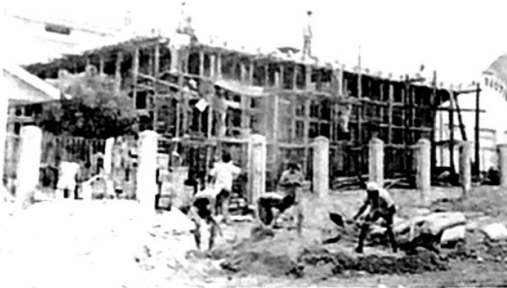
Pouring the concrete roof on the additions to the Auditorium in Pucallpa, Peru. This required 32 hours without stopping. The Mayfields fed them and kept them awake.