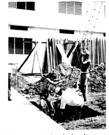
Steel for the concrete column for the enlargement of the church auditorium, Pucallpa, Peru.