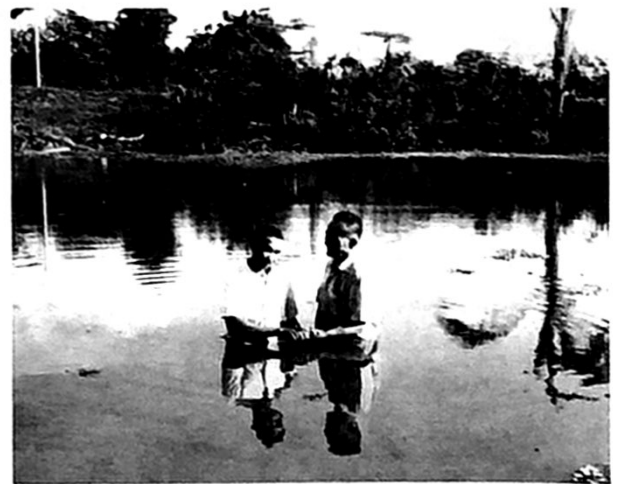
Sostenes Melo baptizing at Peritoro December 6, 1970. Making Baptists in Brazil.