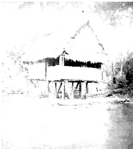
Pastor's home at San Jose on the Amazon River below Iquitos, Peru. He and his wife have ten children.