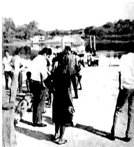
The passengers get off the ferry and wait for the bus to be driven off. Then they get back on the bus and finish the trip.