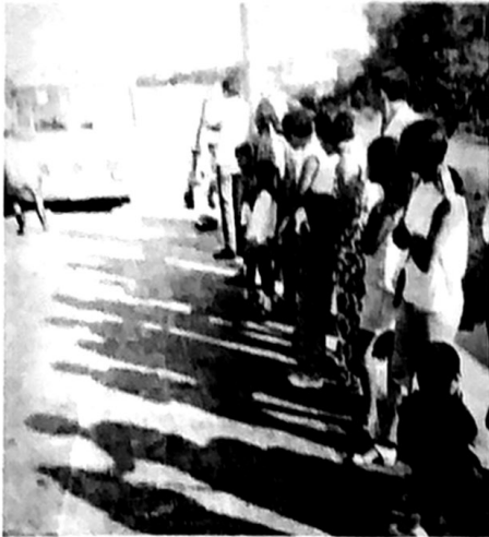
They are building roads in Brazil now. Here is the bus that runs between Manaus and Manacapuru, up the Amazon River. During the trip the passengers must get off and ride the ferry across the water.