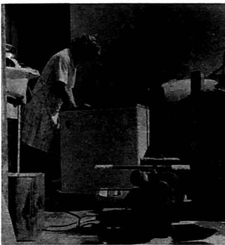
Betty Creiglow washing with the washing machine that some gave money to buy for them. The current to run it is by the generator in the floor that Brother Creiglow's brother in Texas gave them.