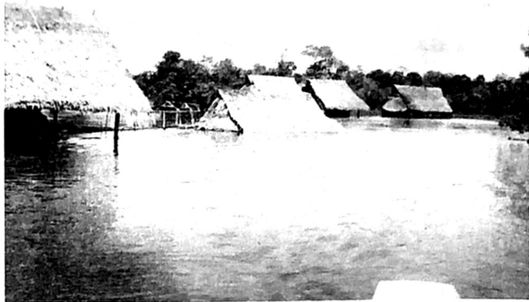
This is across the river near Iquitos, Peru showing how the homes are flooded.