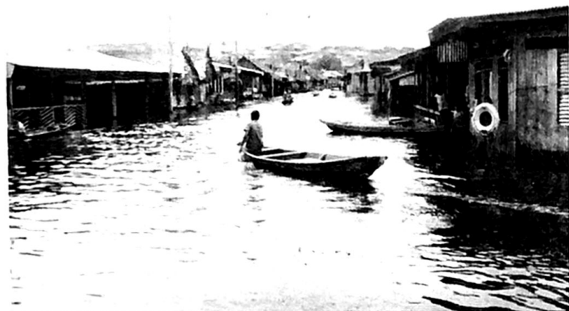
A street scene on the river bank of the mighty Amazon River, in Iquitos, Peru in the part of the city called Belém. This is the highest the water has risen since 1933.