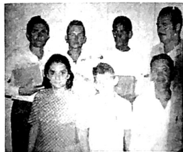
Close-up of seven of the eight students in Bobby Creiglow's Baptist Bible Institute, Cruzeiro do Sul, Acre.