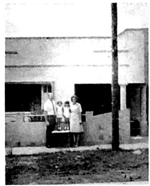
The Bobby Creiglows and twin daughters in front of their new house in Cruzeiro do Sul, Acre, Brazil.