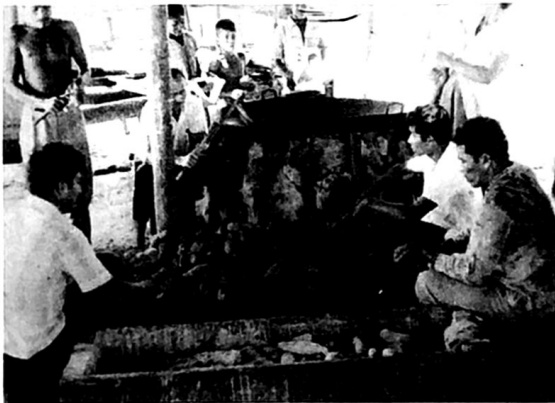
Life in the interior at Canta Galo. Scraping Manioc Root to make Farinha, the substitute for bread. Note the big metal pan on top the fireplace it is roasting.