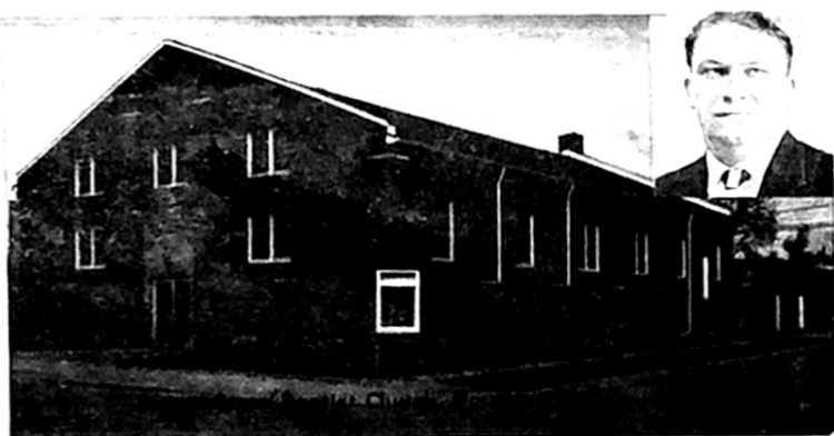
Grace Baptist Church, Warren, Michigan, where Conference services will be held Wed. and Thurs. November 26 and 27, 1969.