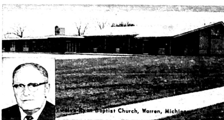
Twelve-Ryan Baptist Church, Warren, Michigan, where Conference services will be held Mon. and Tues. November 24 and 25, 1969.