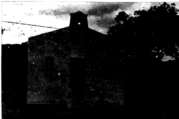
The new Baptist Church Building at Peritoro, Maranhao, Brazil.