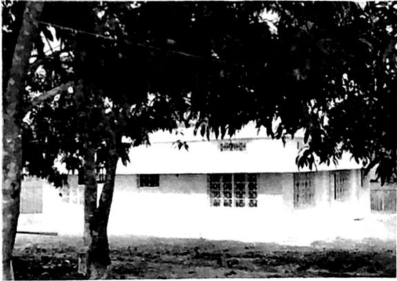
Back view of the Mayfield home in Pucallpa, Peru. Brother Mayfield built this along with all the other buildings.