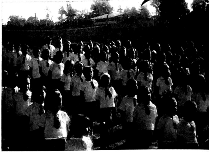
The other side of the school children singing in Pucallpa, Peru. These hear the word of God every day.