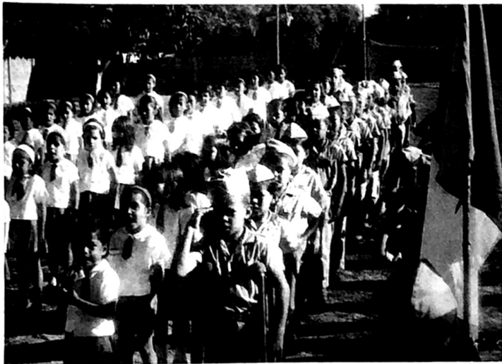
One side of the School children singing in back of the two story building in Pucallpa, Peru.