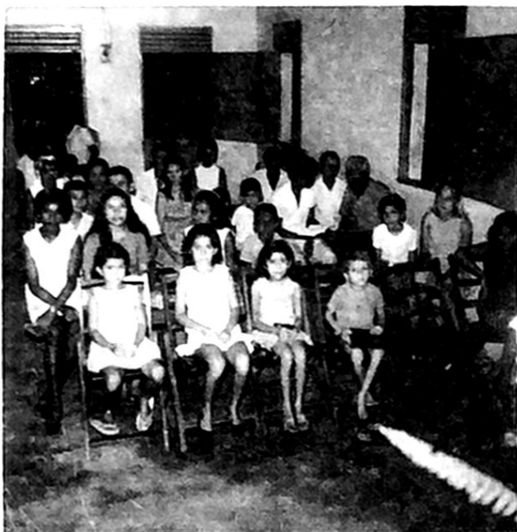
Crowd in New Hope Baptist Church, Sunday May 4, 1969 with some still coming in before the service started.