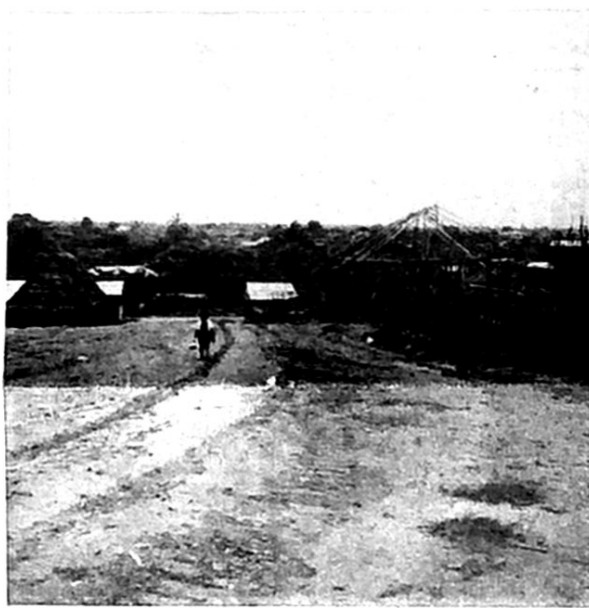
Looking the opposite way down the street for the "Fourth Baptist Mission" building in Iquitos, Peru.