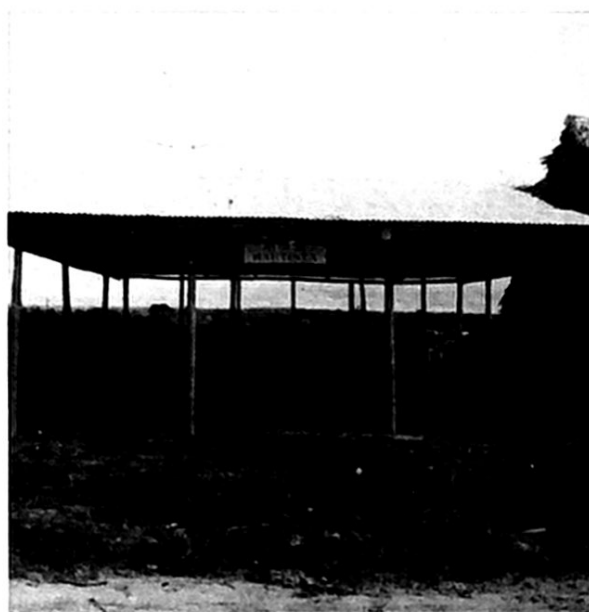
The roof is on and the back wall is up, on the Fourth Baptist Mission Building in Iquitos, Peru.