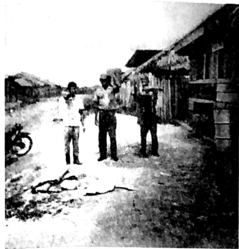
Carrying water from the Itaya River to make concrete for the new "Fourth Baptist Mission" building in Iquitos, Peru. Two of the men have a pole on their shoulder with a five gallon can on each end of the pole. The other has a large pail of water on his shoulder.