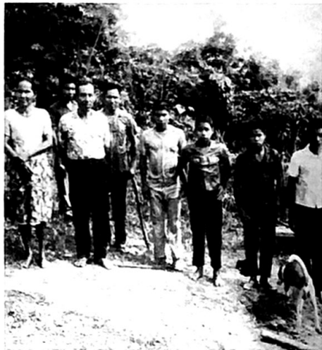
The newly baptized ones at Hojeal, Peru. This church in the interior now has 21 members. "Making Baptist in Peru."