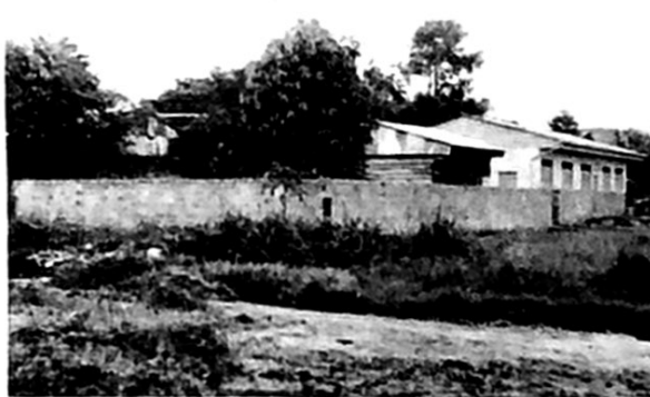
The new Second Baptist Church building in Iquitos, Peru with pastor's house beside showing the wall along the long side in front and short side of the end of the lot.