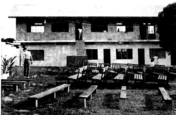
The rear of the two-story school building in Pucallpa, Peru. Second story now completed. Missionary Del Mayfield is standing in the door of the second story. The benches in the rear yard is where the recent revival meeting was held in the open air with over 300 one night and as many as 200 each of the other nights in attendance. As this is being written we need approximately $5,000.00 to finish paying for the wall fence and second story of the building. Mark offering "For Pucallpa Building".