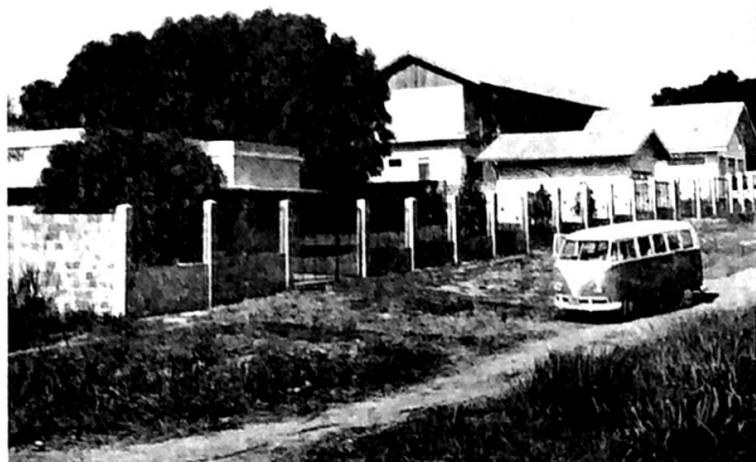
This view is of the beautiful buildings and ground in Pucallpa, Peru. Missionary Del Mayfield built all these buildings and all are the property of Baptist Faith Missions. On the left is the house the Mayfields live in, next the boat house and then the church and two-story school building. The wall fence at the left goes around three sides of the property and the wall at the bottom with steel fence in across the front.