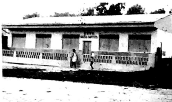
The new Second Baptist Church building in Iquitos, Peru showing the wall fence in front. The steel fence is to be put on top of the wall yet. The building was built by Missionary Walter Lauerman.