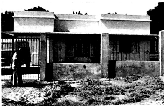
This is the front view of the house that the Mayfields built and live in in Pucallpa, Peru. The windows are barred with steel to protect from breaking and entering. To the left is steel gate with Volkswagen Station Wagon in front of the built-in garage. Brother Mayfield is an experienced builder.