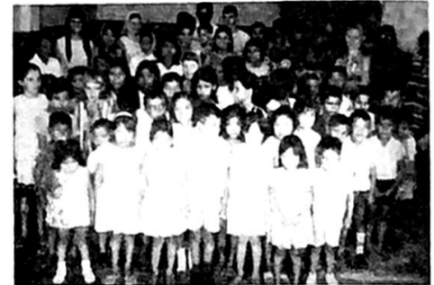
Group inside the First Baptist Church, Iquitos, Peru one day during the Bible School. The attendance averaged about 65.