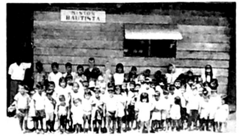
Bible School at the Third Baptist Mission, Iquitos, Peru. The Lord is blessing the work at this mission. The attendance is very good here.