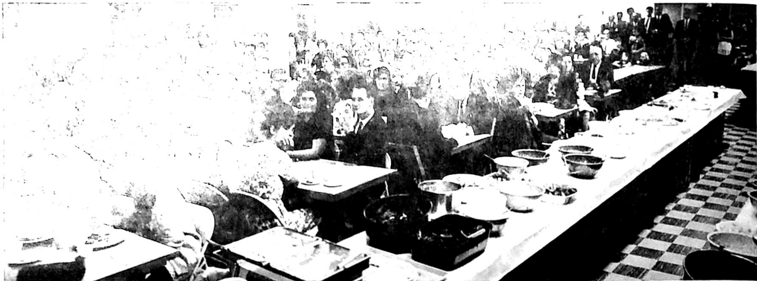
Supper time Tuesday night in the Grace Baptist Church Annex during the Thanksgiving Conference. Some of the people at the left are not shown in the picture. There were more present than could be seated at the tables and had to wait for others to finish.