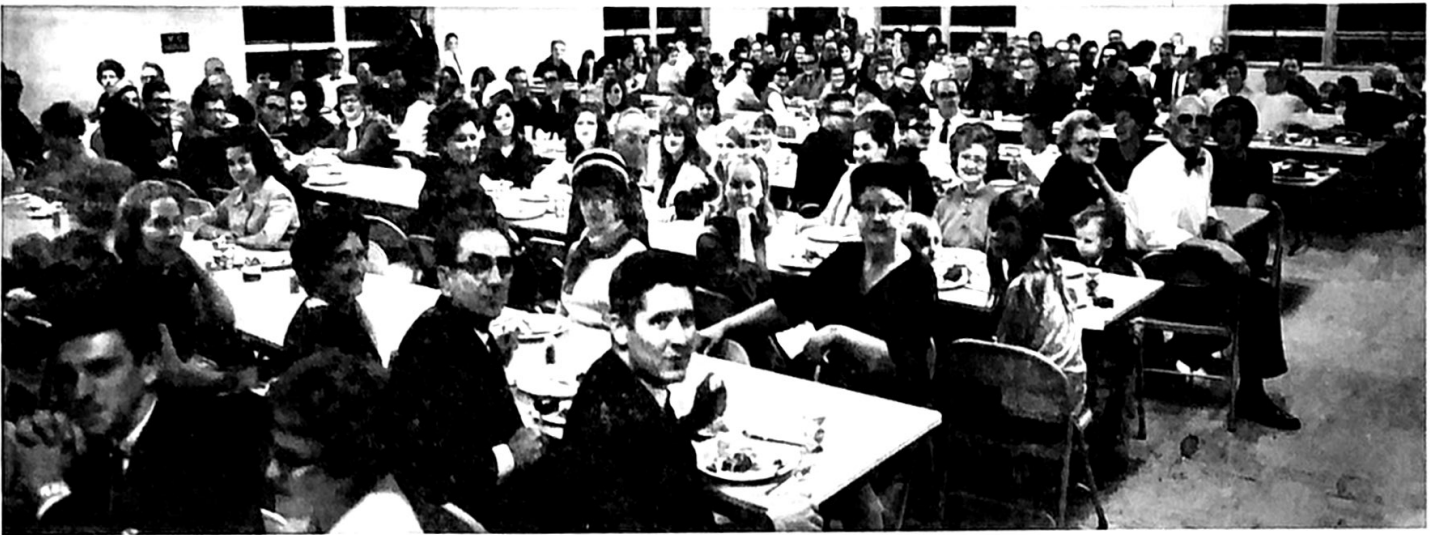
Supper time Wednesday night in the Twelve-Ryan Baptist Church Annex during the Thanksgiving Conference. People at the left are not shown in the picture and all could not be fed at one sitting.