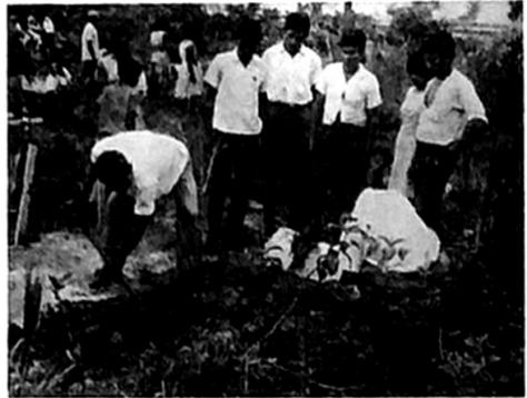
Digging the grave at the cemetery while the sorrowing parents look on. This is the man who rows across the Amazon River with his family in a small canoe to attend all the services of the First Baptist Church in Iquitos.