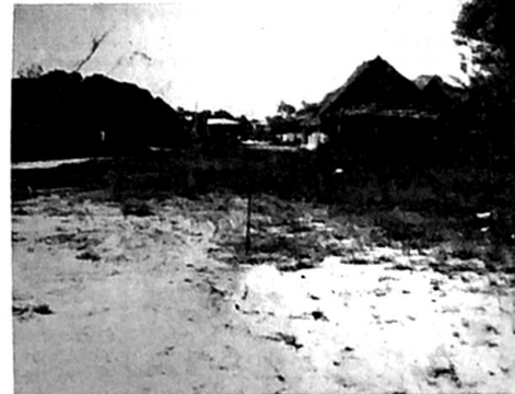
Standing in front of the new building and looking down the street you see the neighborhood. Poor and neglected but have the gospel preached to them and they make the best. July 1968.