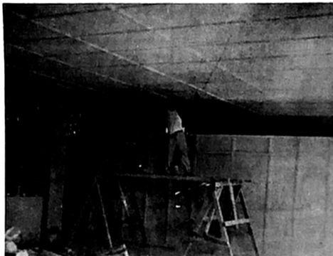
Purification painting the ceiling in the new church building. June 1968. Building to be dedicated in July when Harry Hille visits with the Lauermans.