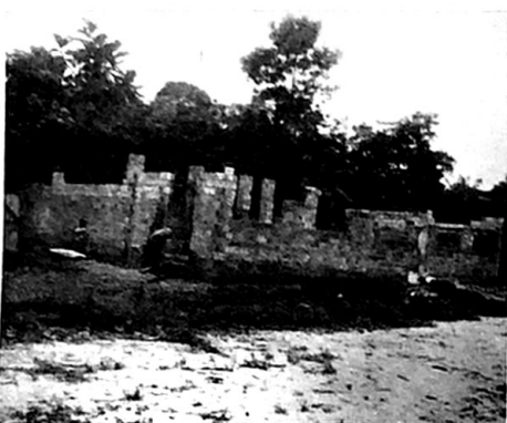
Walls going up showing window openings. Walter Lauerman is the builder with three native preachers helping. March 1968.