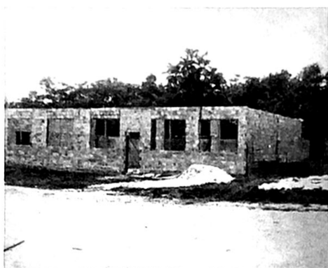
The walls are finished and ready for the roof. Really looks good doesn't it? April 1968.