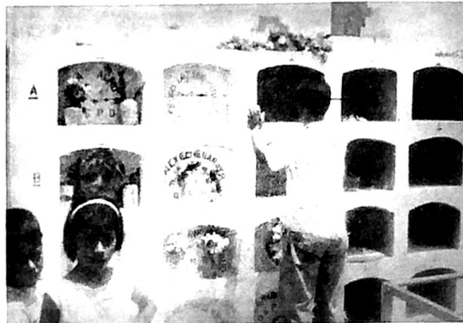
Worker sealing the end of the vault with cement after the child is buried. Thus you see in pictures something else that missionaries do.