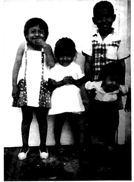
Four happy Peruvian children in Pucallpa, Peru, where Del Mayfield is a missionary.