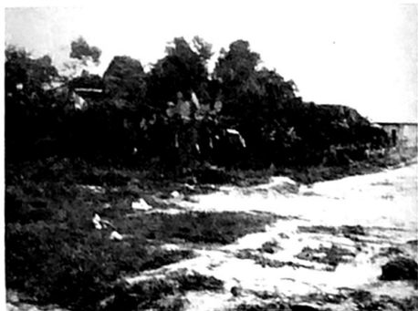
Lot for new building in Iquitos, Peru. The lot is covered with bushes and weeds and the street is dirt. January 1968.