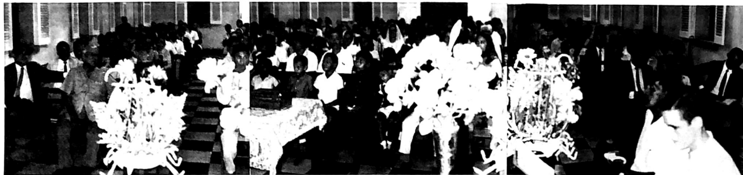
Night service of Conference in Manaus, Amazonas, Brazil. When we received this picture and looked at it, tears of joy came to our eyes. We are sure that every supporter of Baptist Faith Missions would have liked to have been there.