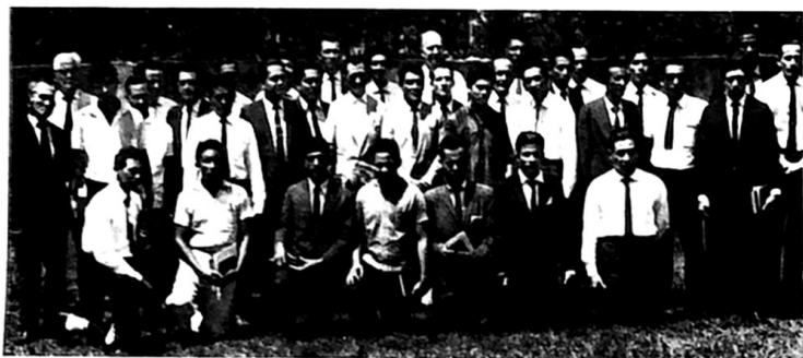
Thirty six of the forty one preachers who attended the conference in Manaus, Amazonas, Brazil.