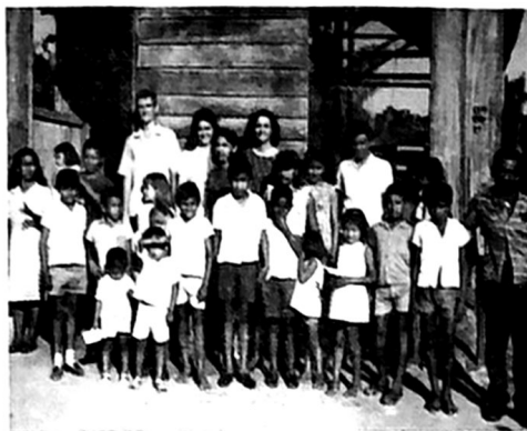
Beautiful Garden Baptist Church. Services are held here each Sunday afternoon. In addition to the schools all week, and morning and night services at Tabernacle Baptist Church, the Hatchers hold services here on Sunday afternoon.