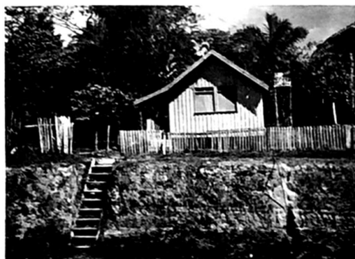
1. This picture shows the house used for the boy's dormitory of the Preacher's School in Manaus. The property line starts at the left side of the steps.