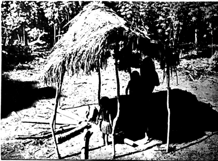
This woman and children are in the only house they have. Note the bananas for food hanging inside. Interior from Iquitos, Peru.