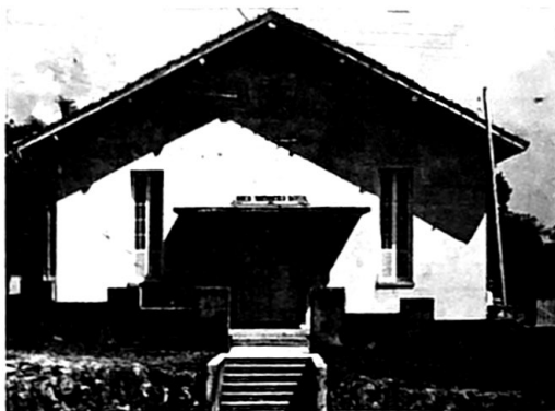
2. This picture is just to the right of picture one and shows the front of Tabernacle Baptist Church. The two story Breezeway and two story school building are back of the church building.