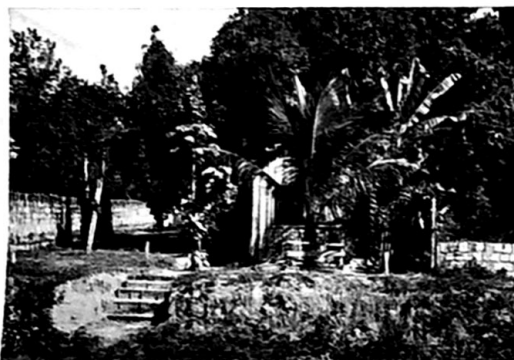
4. This picture is next to the right of picture three. The house in the center with lot frontage of 24.6 feet is not ours. We have a frontage of 382.2 feet with this small house in the center of the frontage.