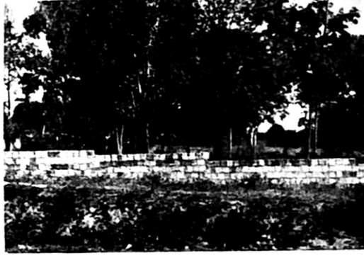
6. This picture shows the vacant lots to the right of picture number five. Note the wall fence in front of the property. There is still on vacant lot to the right of this picture.