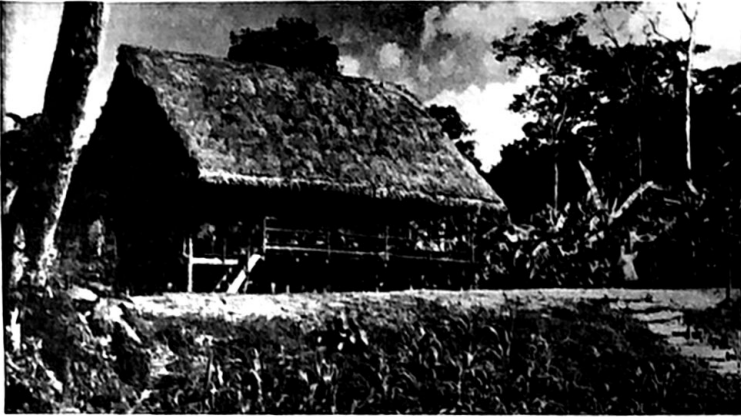
One of the nicer houses on the bank of the river in the interior near Iquitos, Peru.