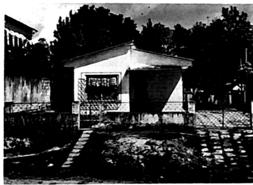
3. This picture is next to picture two. This brick house serves as the boy's dining room and for the cook and family, note part of the School building at top left of picture.