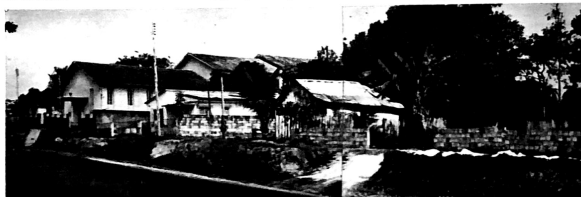
This is a Panoramic view showing all the buildings and about one half the street frontage of the Manaus Baptist Seminary. First building to the left is the boys dormitory, then church, with school building in the rear then boy's dining room and cook's house then the house with metal roof last. The house not owned by the mission is to the left of the last house but not seen in the picture.

Second Class Mail Privileges Authorized at Warren, Michigan