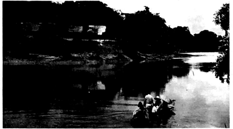
River scene near Iquitos, Peru. Note how near the water is to the top of the canoe.