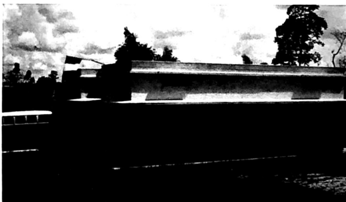
The Del Mayfield home, Pucallpa, Peru. The Volkswagen station wagon can be seen in the picture. The church and school building is at one end of the building site and the home at the other end.