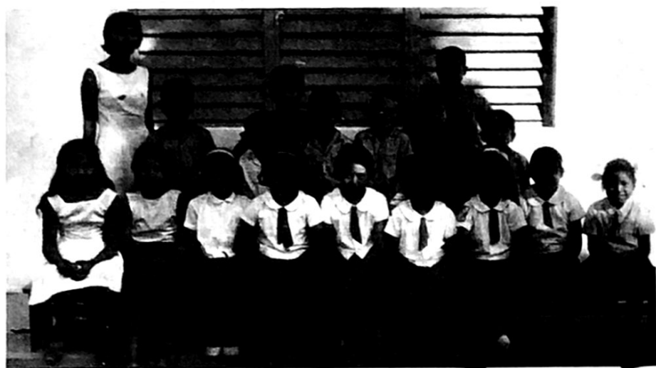
First Grade Class in the Baptist School, Pucallpa, Peru, with one of the teachers of the school.