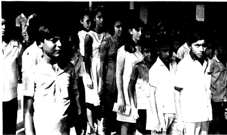
Grade School Classes, Manaus, Amazonas, Brazil lined up ready to enter classrooms.