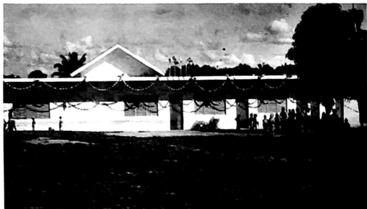
This is how the new school building looks at Pucallpa, Peru. It is attached to the rear of the church building. The rear gable end of the church building can be seen above the roof of the school building.