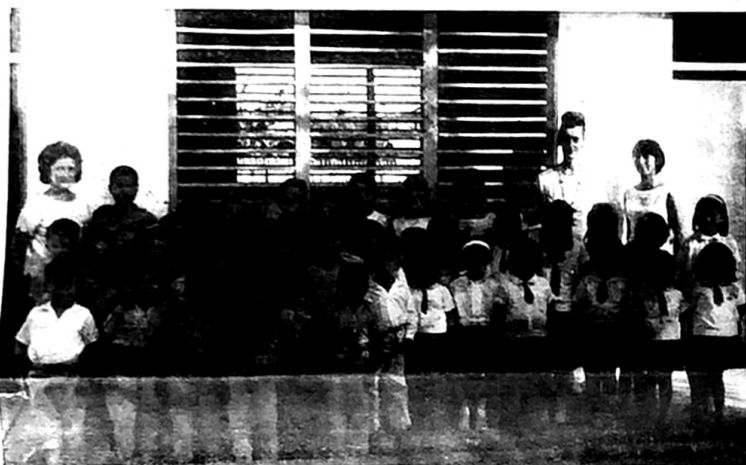
Kindergarten school children, Pucallpa, Peru. These hear the word of God every day.