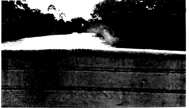
This picture was taken from the rear of the Launch looking back down a narrow channel which in high water time connects the Rio Negro and the Amazon Rivers which is used as a cut-off and saved about three hours of time.