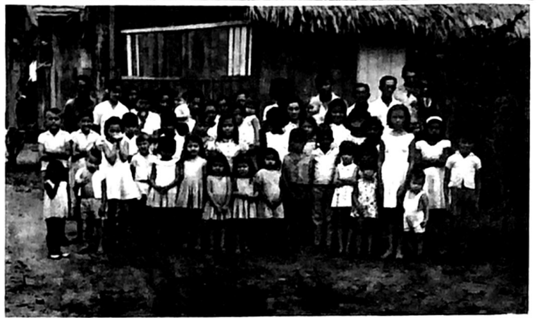
Sunday School at the mission point in Manacapuru, Amazonas, Brazil.