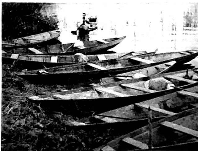
"CARS" parked in front of the First Baptist Church at Janauca. Eight canoes parked with another coming in.