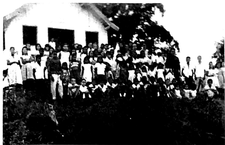
Anniversary service at the First Baptist Church at Janauaca in the interior of Brazil.