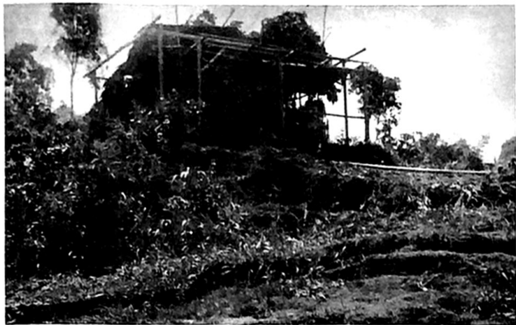
The family who lives in this house are members of the Baptist Church at Tamschiayu, Peru.