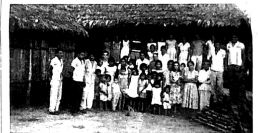
Crowd at the mission point, at Iquarape Penecostes.