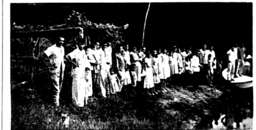
Crowd that came to see the baptizing at Penecostes.