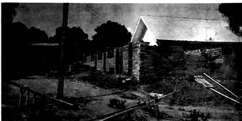
The Sunday School rooms going up at the new church building in Pucallpa, Peru. Included in this is a baptistry for the church. Brother Mayfield would like to go right on and finish this building, but he needs the funds to do so. Please pray about this need and send your offerings marked "For Building in Pucallpa". It is needed now. This picture was taken July 9, 1966.