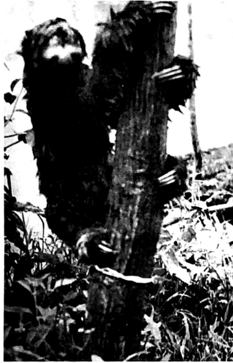
Brother Bratcher met this fellow, a "Preqica" climbing a tree at Aurupa in the interior.