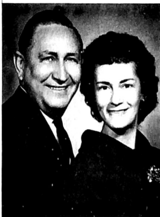
The Del Mayfields Pucallpa, Peru, S. A.