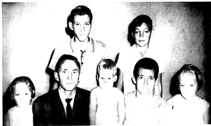
The George Beans Sao Luis, Maranhao, Brazil, S. A.