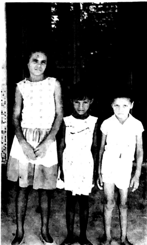
Three baptized into the Chapoda Baptist Church, Manaus, Amazonas, Brazil.