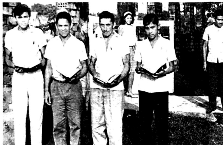
These four young men surrendered to the call to preach in the 14th of December Church, Manaus, Amazonas, Brazil.