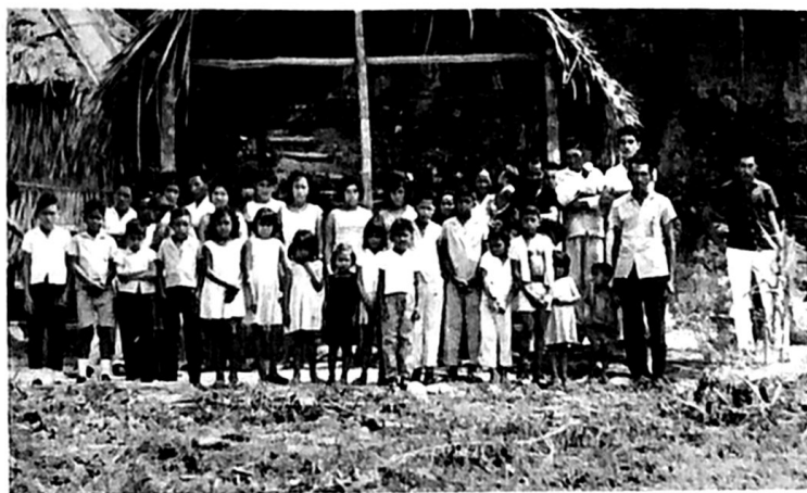
Sunday morning, October 17, 1965 at Amatori. This place is a mission on the Amazon River between the mouth of the Preto River and the mouth of the Urubu River.