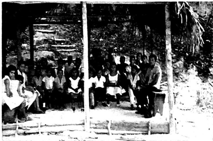
Sunday Morning, October 24, 1965 all seated inside the building ready to hear Harold Bratcher tell them about the Blood of Jesus Christ that washes white as snow. The building is air conditioned but the pews are not cushioned according to Brother Bratcher. The dog slept through the sermon.