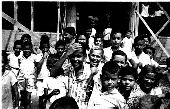
School is out. These are some of the children that came the last day of the Grade School to get their report cards.