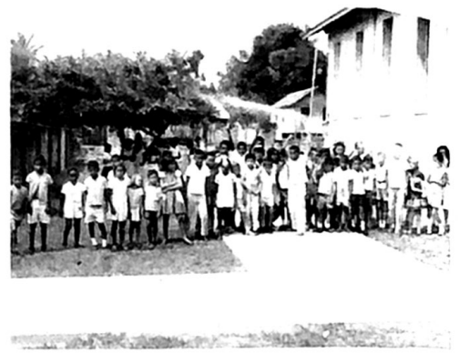
A group of children on the last day of Grade School in Manaus, Amazonas, Brazil.