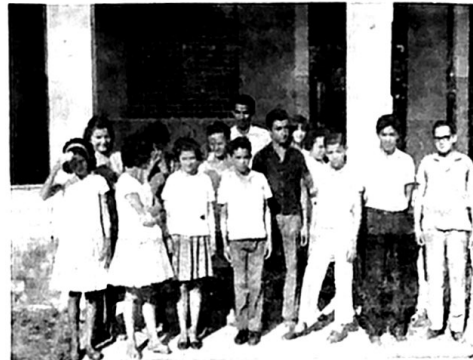
SIXTH GRADE. Thirteen out of 20 sixth grade students. All together about 170 boys and girls have the Bible taught to them every day.