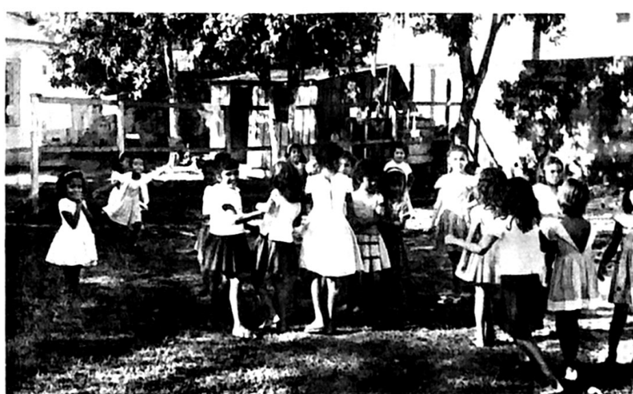
Another scene at recess time. These children get an education, a Baptist education and hear the Bible taught every day.