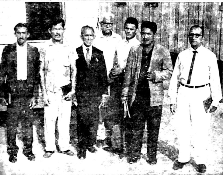
These Brazilian Preachers formed the council at the organization of the Bairro Vermelho Baptist Church, Manaus.