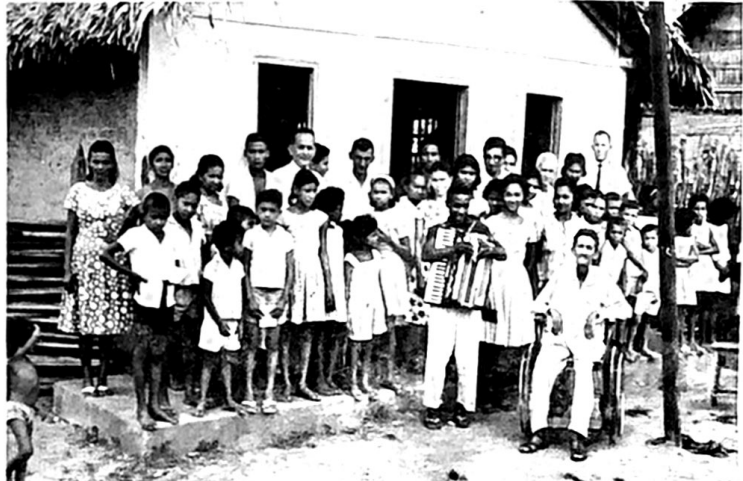
Close up of the Crowd in front of the Petitoro Baptist Church. This new church now has four missions active and going and plan to start more. Our first church in the State of Maranhao.