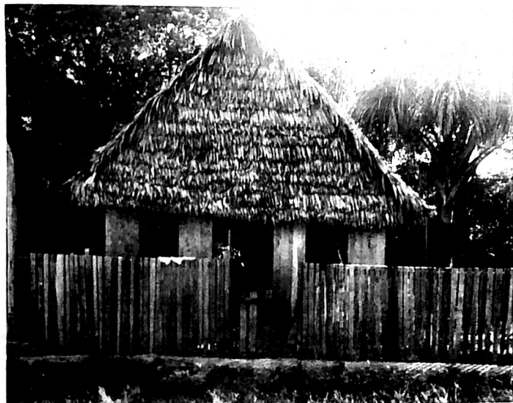
New "Meeting House" for the mission at Tamshiyacu, Peru. It has a thatched roof, but they hope to have a galvanized metal roof in time. As soon as some of the believers get legally married, they will be baptized and then, with a few more they plan to organize into a church, the Lord willing.

Remember Baptist Faith Missions In Your Will