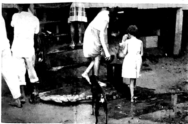
After getting back from the baptismal service it took about a half hour for the "foot wash" baptisms to get their feet clean enough to go into the house for service. It took two people busy carrying water for the "foot wash".