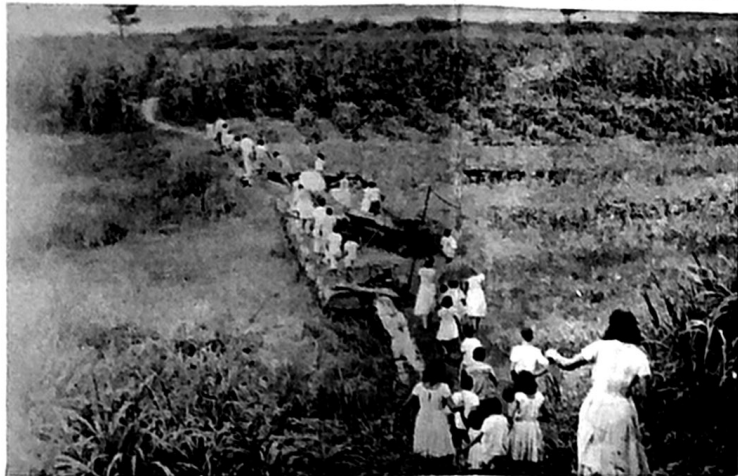
On the day of the organization of the church on the Ilha de Paciencia the first part was the baptism of several who were to become charter members of the new church. Here we see the people going to the bank of the Amazon River, under the rain, for the baptism.