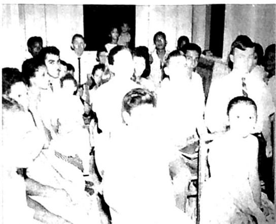
Partial view of the crowd inside the building at the organization of Mariah Baptist Church.