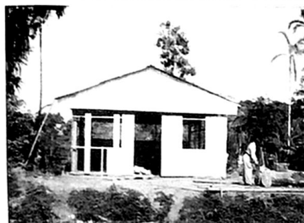
This is the new church building at Astoria, Peru that is partially completed. This building has a galvanized roof.