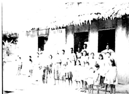
This is the Hojeal Baptist Church building showing the old thatch roof.