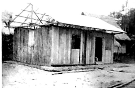
Church building at Hojeal, Peru with part of the new galvanized roof on, replacing the old thatch roof.