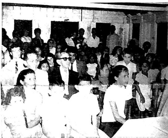
This is part of the crowd inside at the organization of the Peniel Baptist Church 20 minutes before starting time. The house was filled, the aisles were filled.