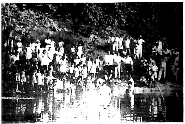
Another Baptismal scene at Usina do Brasil.