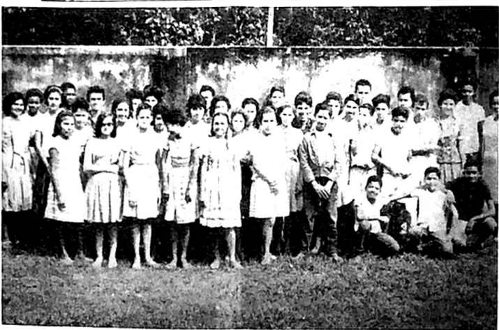
The student body of the Baptist High School, Manaus, Amazonas, Brazil at the close of the term in June 1964. The two standing on the right are teachers.