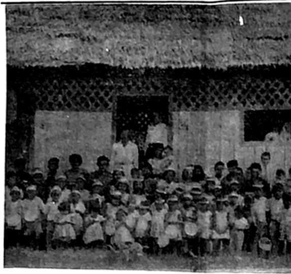
CARIDAD. This place is on the Ucayali River about a half day travel down river from Pucallpa, Peru. These pictures show the value of the houseboat to live on as well as travel in.