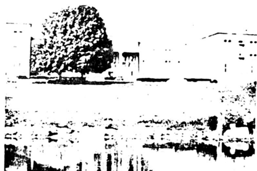
THE CONFERENCE GROUNDS