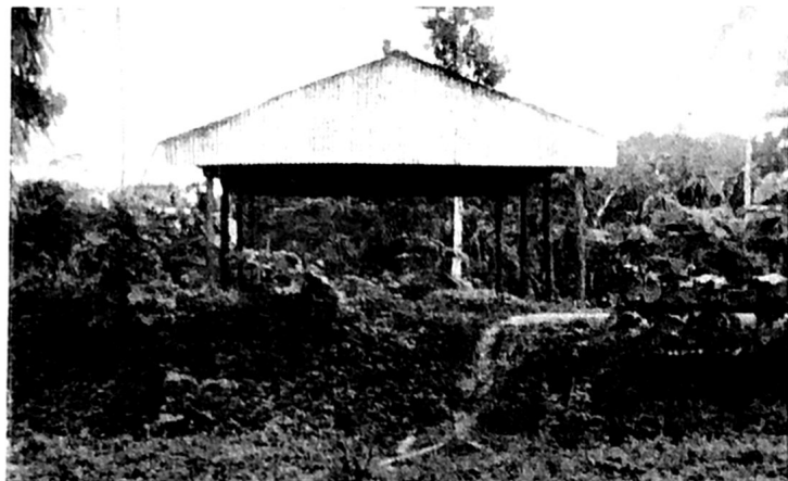
ASTORIA. This is the new church building at Astoria on the Amazon River at the mouth of the Nanay River near Iquitos, Peru. It should be completed soon, the Lord willing. With a galvanized roof it will last for many years.