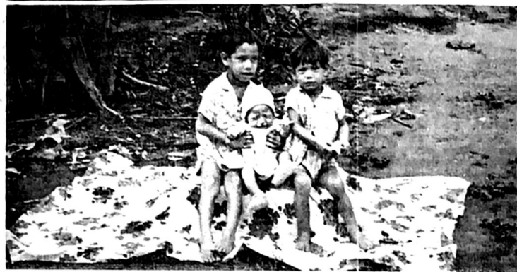
Three little ones at Murituba that need to be taught more about the saviour.