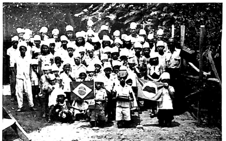
Daily Bible School at Murituba, These children heard the word of God daily for several days.