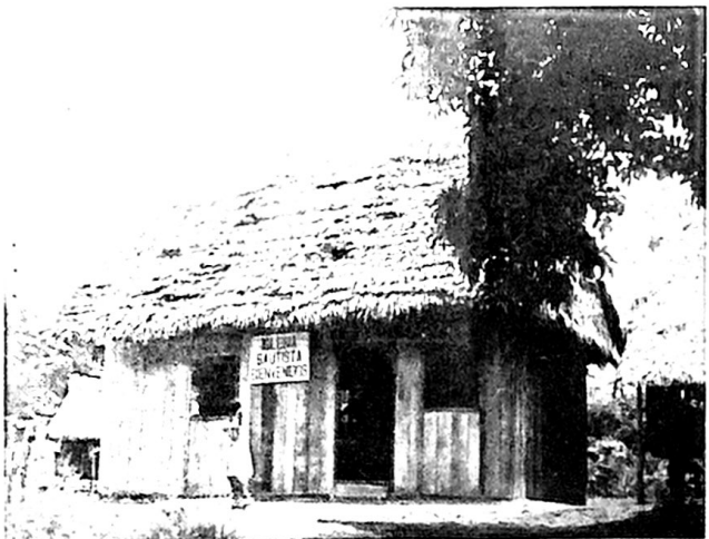
Building of the church at Hojeal, Peru since they have put up the walls around the building.