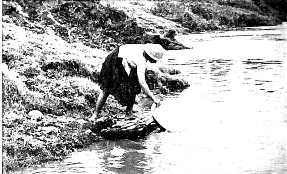
A young woman in the interior of Brazil at the "HELPY-SELFY-LAUNDRY" at Murituba.