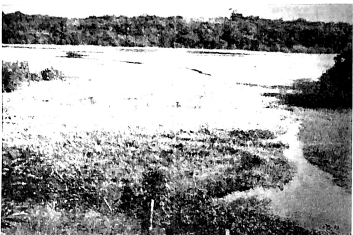
This is the path through the water that leads to the house where the Bratchers stayed while at Januaca.