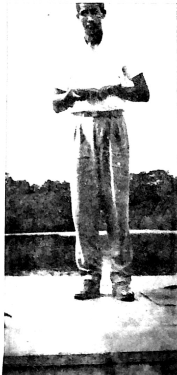
This young man is a student in our Baptist Seminary in Manaus Amazonas. He is from Janauaca Baptist Church that was organized last year about a days journey from Manaus, Amazonas.