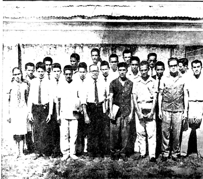
Student body of the Preacher's School in Manaus, Amazonas, Brazil February 12, 1964. There are 21 in this picture. One is a teacher and one is too young but permitted to sit in the classes. This is the largest enrollment we have had so far. We need Fifty Thousand dollars to expand the Schools in Manaus and to build a dormitory for the students to live in. Pray much about this need and give as the Lord shall lead and enable. Brethren let us all get a vision of the need for trained Brazilian Preachers. We have more churches than we have preachers.