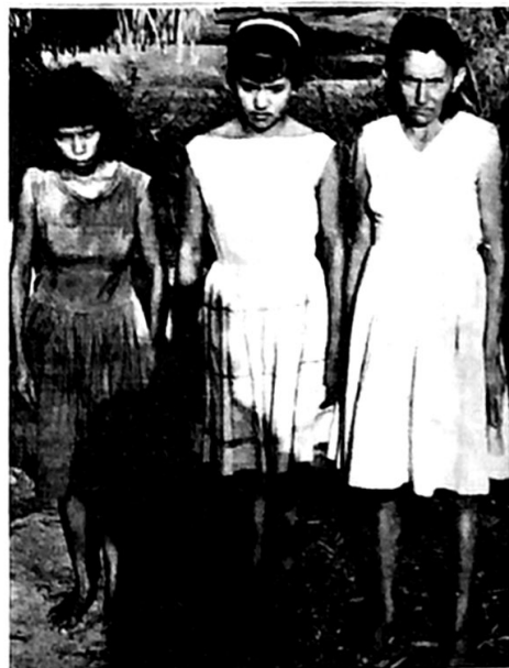
These three made profession of faith at Januaca in January 1964.