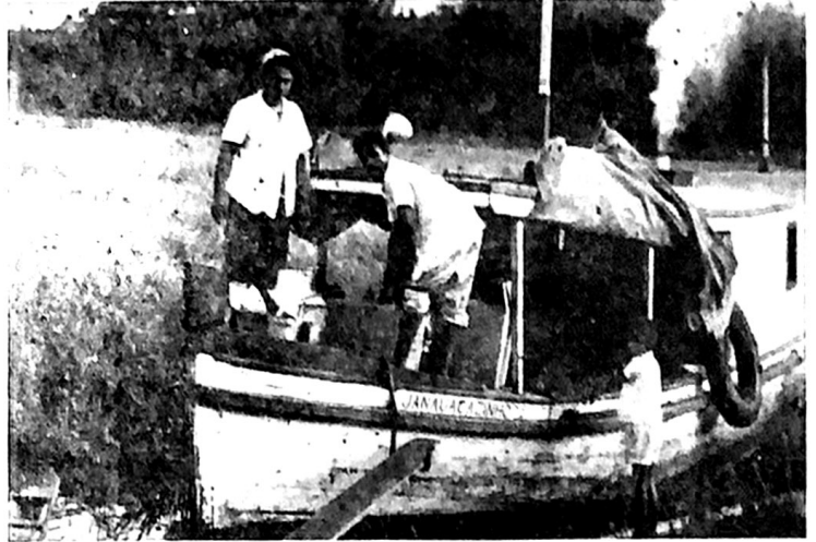
The Bratchers have arrived at Janauaca.