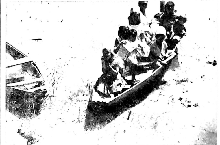
These are some of the children returning to their homes from the Vacation Bible School at Janauaca Baptist Church.