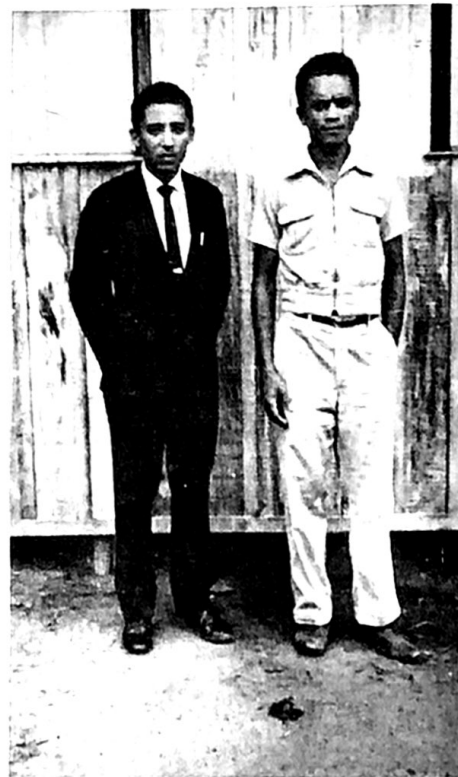
These two young men are faithful members of the Chapada Baptist Church, Manaus, Amazonas and both are preachers attending the preacher's school in Manaus.