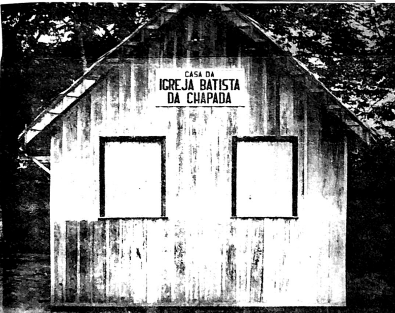
The Chapada Baptist Church Building, Manaus, Amazonas, Brazil. The school building of this church is just to the left along side the church building.