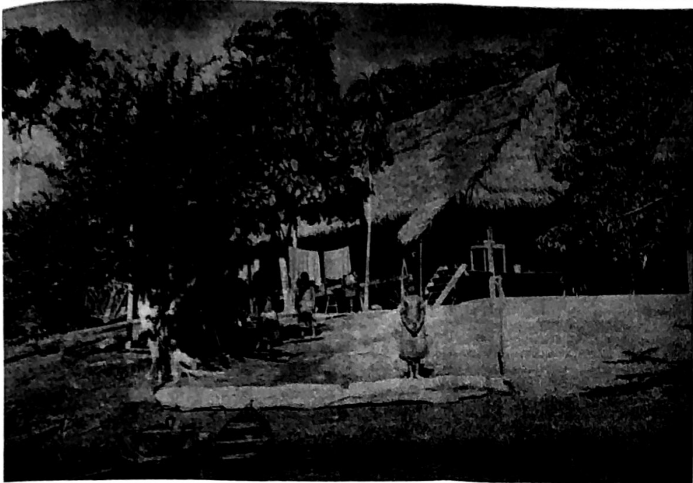
A scene on the bank of a stream in Peru as the missionary arrives in his boat to preach the word of God.