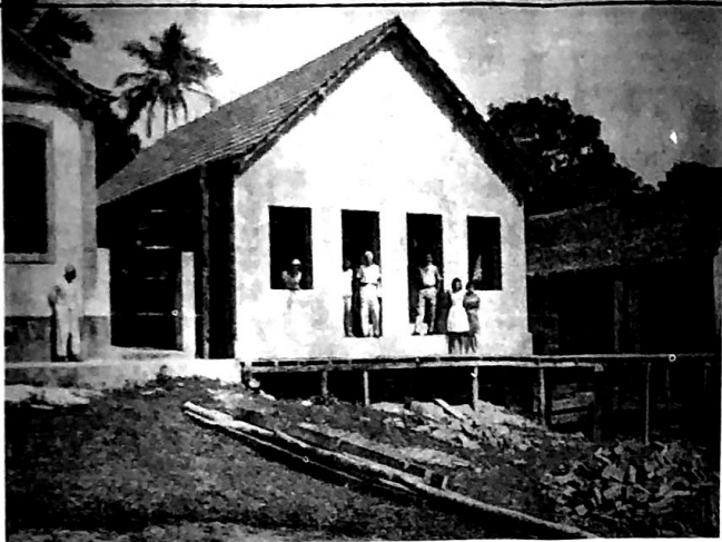
The new Faith Baptist Church building in Cruzeiro do Sul, Acre Brazil. This building was torn down and rebuilt completely with tile roof and brick front with stucco plastered on. This was done by Brother Creiglow since Brethren Overbey and Henderson were there in January.