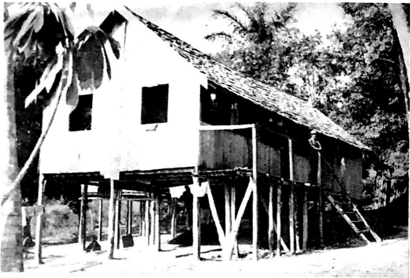
This is the house at Jeturana that the services were held in. This is across the river from Terra Nova Baptist Church.